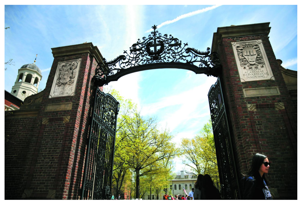
Attending Harvard or similar institutions might not make students as liberal as conservatives fear.